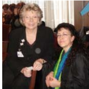
European Commissioner Viviane Reding , European Commission Vice-President, in charge of Justice, Fundamental Rights and Citizenship, Commissaire Européenne Viviane Reding, Vice-Présidente de la Commission Européenne responsable de Justice, droits fondamentaux et citoyenneté, Brussels