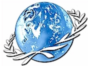
The Millennium Project