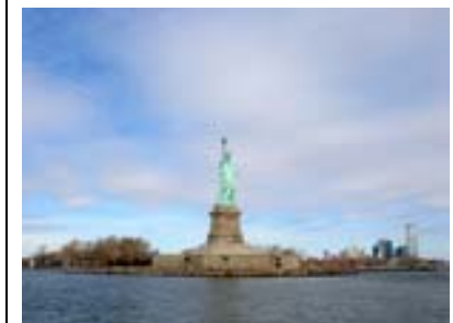
An honorary member of Millennia2015, not a dream but a vision