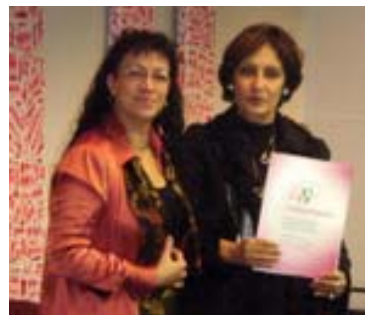
H.E. Ambassador Naéla Gabr , Chairperson of the Convention on the Elimination of all Forms of Discrimination against Women - CEDAW;