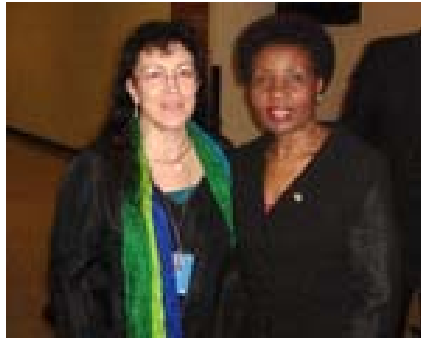
Dr Asha-Rose Mijiro , Deputy Secretary-General of the United Nations Vice-secrétaire générale des Nations-Unies, New York