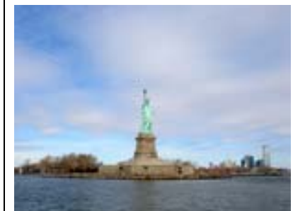
An honorary member of Millennia2015, not a dream but a vision